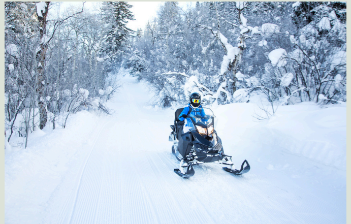
Snowmobile Operator Course